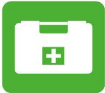
FIRST AID KITS