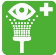
EYE WASH STATIONS